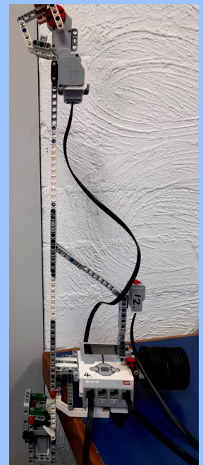
EV3 Drop Tower